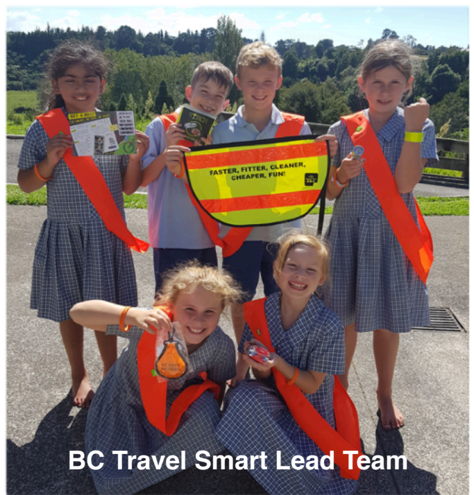
BC Travel Smart Lead Team

Entries close 29th May 2018, and the winners will be drawn 5th June.