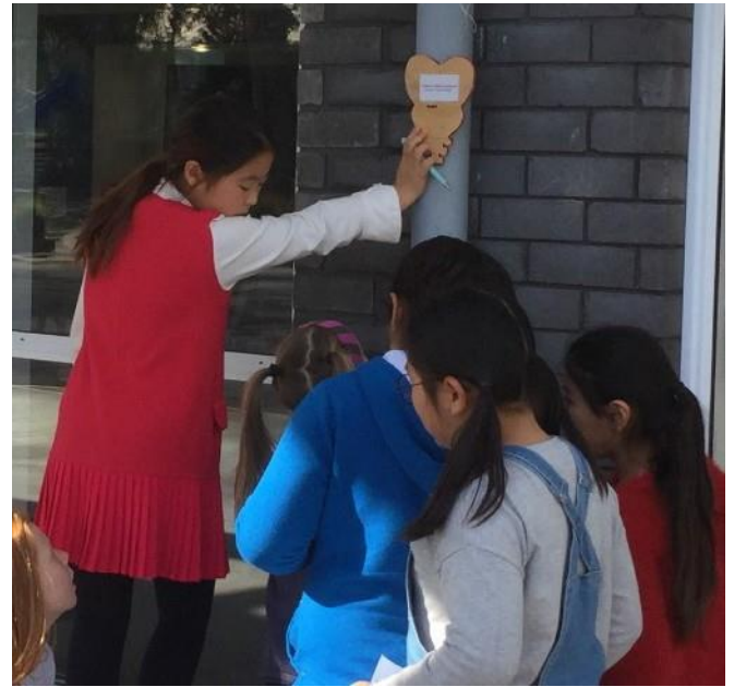
On a 'Tiki Hunt'