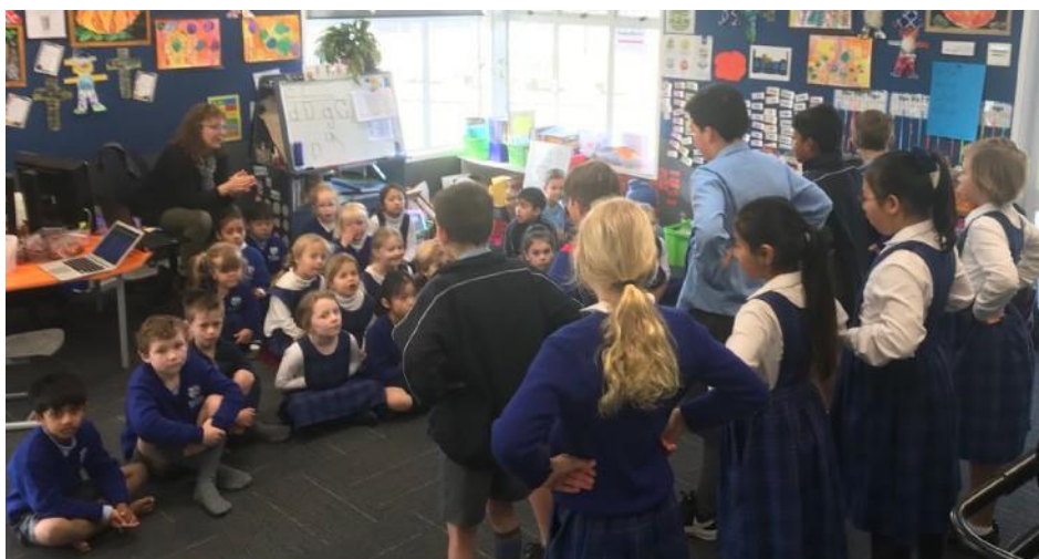
E1 Haka Presentation