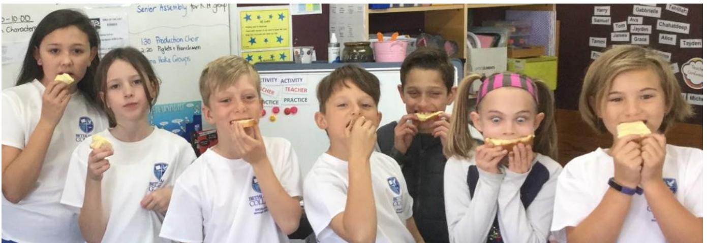
E1 Eating Rewena Bread