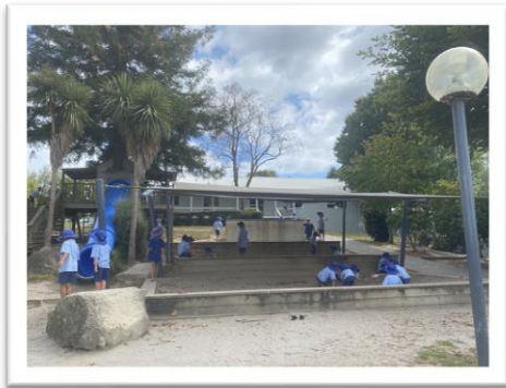
The playground was busy on Day 1

A very warm welcome to our 2021 school year, what a joy to see the wonderful smiles of the children excited to be back. An extra special welcome to all our new students to the Bethlehem College Primary whanau. We have had a smooth start and as routines are established your child(ren) are becoming more and more familiar with their class expectations. Thank you for the way you are already supporting your child's teachers as they begin to get to know your child by providing helpful information and most of all praying for them.