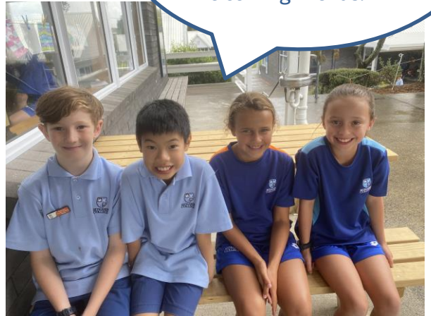
New Te Maunga Students

Lots of do! Choir! Jump Jam! Long lunchtime! Christian School! Welcoming friends!