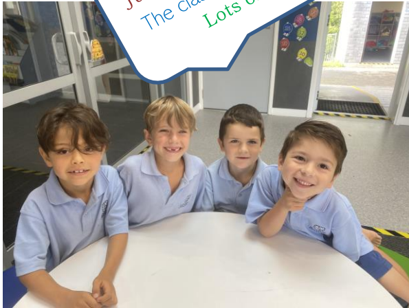
New Te Aka Students

Big Space! Jump Jam! The classroom space! Lots of Friends!