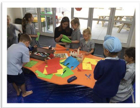
Making bird kites at learning through play

We went to Prestons park and heard about our awesome outdoor classroom. We used the information station with the QR code's to take us to the app with interactive wildlife and trees to discover online.