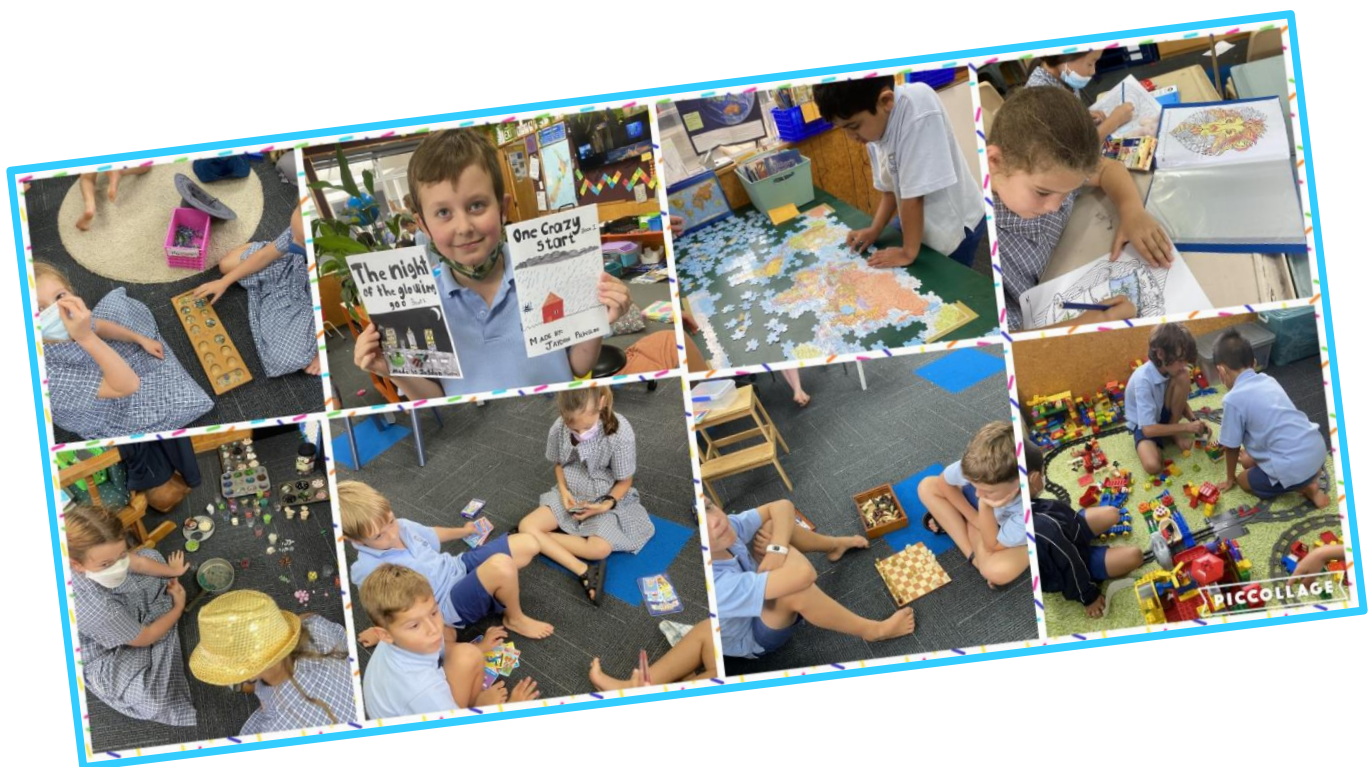
The children make the most of being back together playing a variety of games and or creating things.