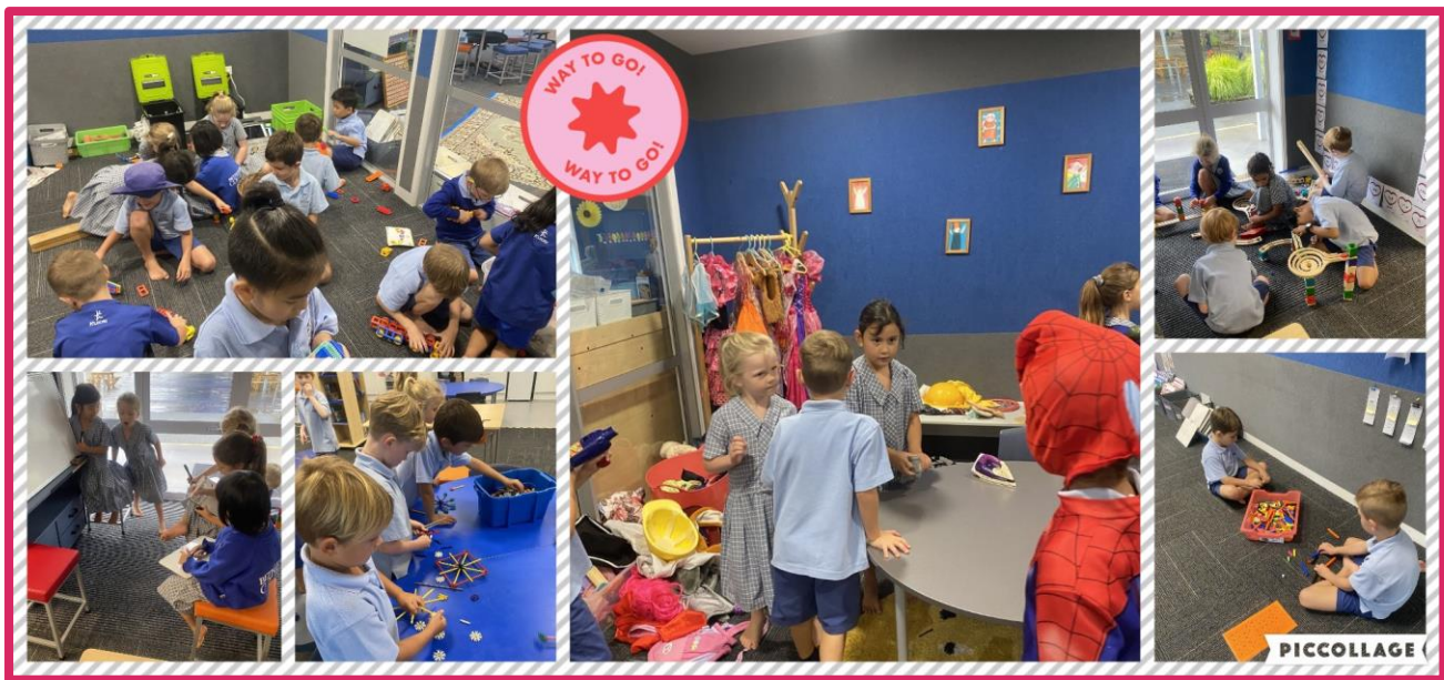
Wet day play days - B block children enjoying time together during a wet morning tea!