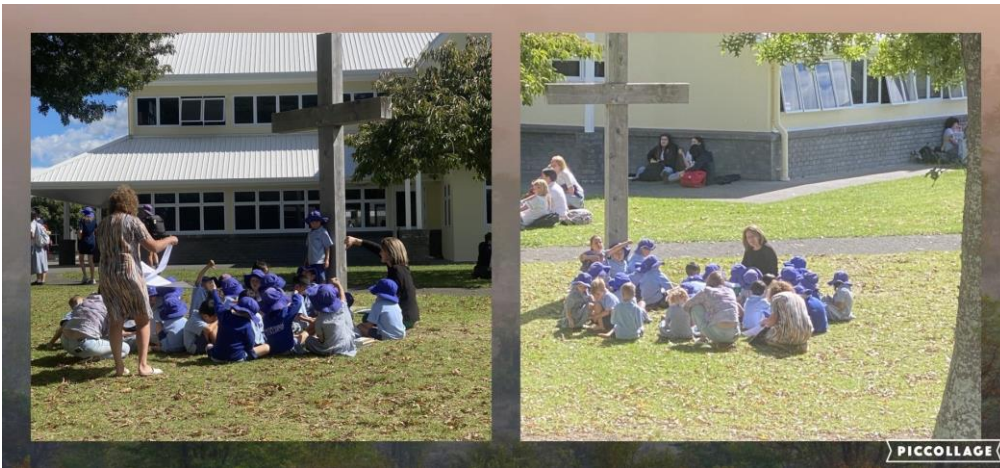
A1 & A2 preparing for Easter Celebrations