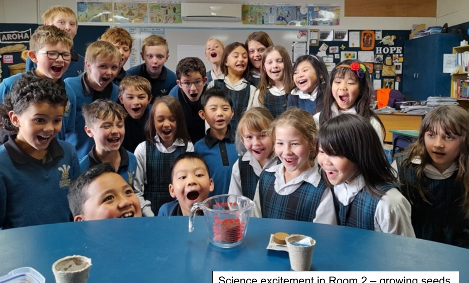
Science excitement in Room 2 – growing seeds