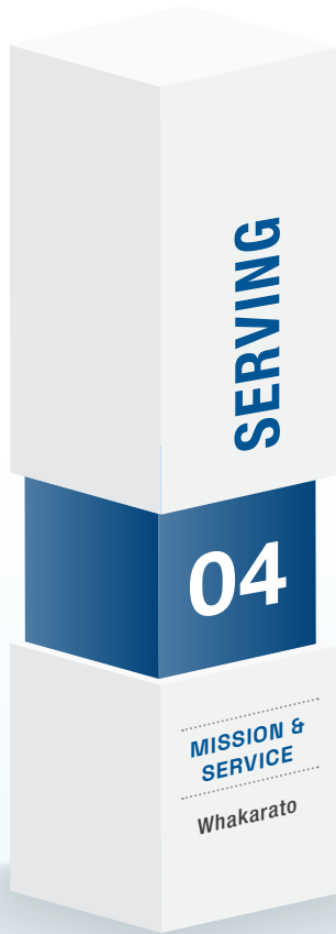
NELP 1, 2, 3, 4