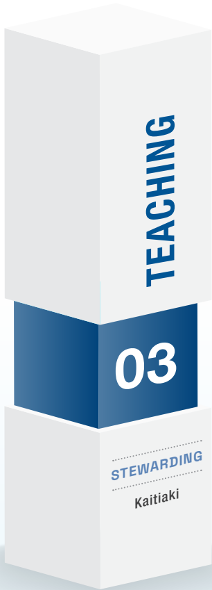
NELP 1, 2, 3, 4