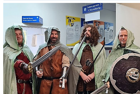
Well done Secondary for raising over $1,200 for YWAM Ships Ministry through Mufti Day! Photo: The warriors in the IT Department.