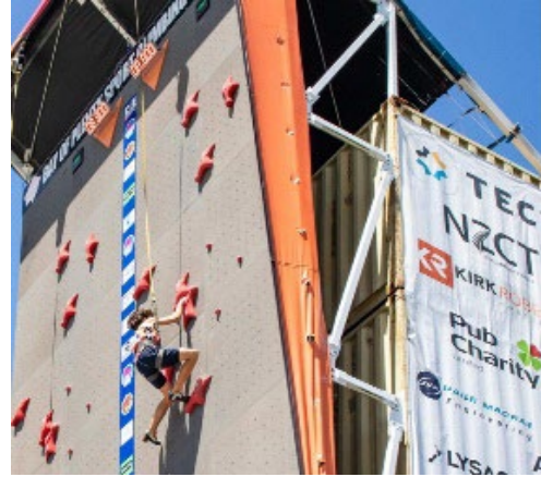
2 nd in u17 Speed Climbing Nationals