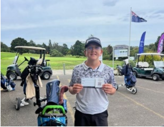
8 th at BOPSS Golf Championships